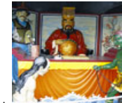
10 chambers of